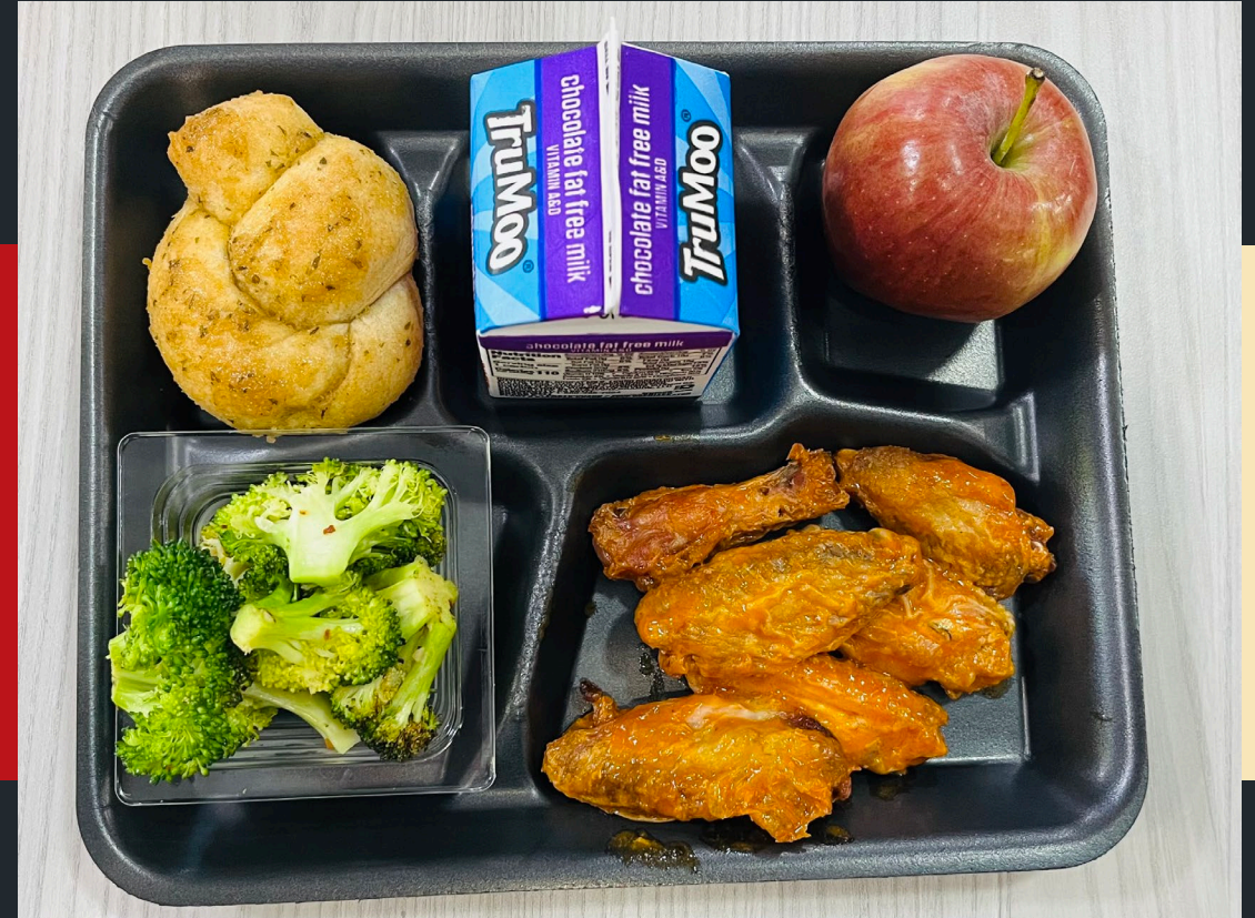
Manor ISD-Common Market